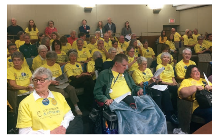
A hearing on Minnesota's medical aid-in-dying bill was attended by over 100 Compassion & Choices supporters.

Our California team celebrated the release of a new comprehensive study on aging and illness by the California Health Care Foundation (CHCF) on October 30. Among the findings is sustained support for the End of Life Option Act: 75% of Californians, a resounding majority, approve of the state's medical aid-in-dying law across race, ethnicity and income levels. In addition to these very encouraging results, the CHCF report supports the education and outreach our Access Campaign is built on: patient-directed care and a desire to have complete information about end-of-life options. Nearly 9 in 10 people expressed a desire for palliative or hospice care if they become seriously ill, but only 4 in 10 receive this care. Only 1 in 5 seriously ill or senior patients talked with their physician about their choices for the end of life. We continue to encourage doctors to discuss these issues with their patients.