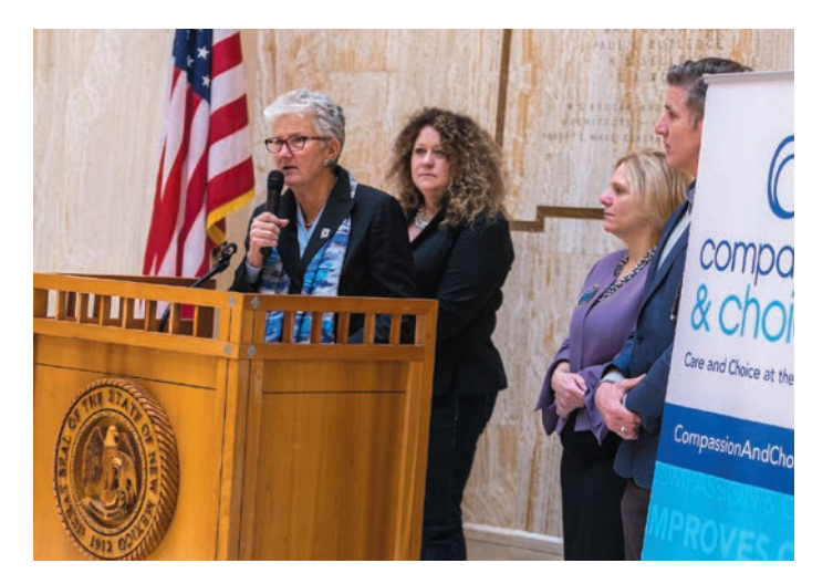
New Mexico Senator Liz Stefanics (bill cosponsor) speaking at a lobby day at the New Mexico Capitol in 2019.

New Mexico remains primed to consider medical aid-in-dying legislation, hopefully in the very near future. We anticipate that our previous bill sponsors will reintroduce legislation for the next 60-day legislative session, scheduled for 2021. In 2018, Governor Michelle Lujan Grisham told the Albuquerque Journal, "We should provide patients with humane end-of-life options, including medical aid in dying for terminally ill, competent adults."